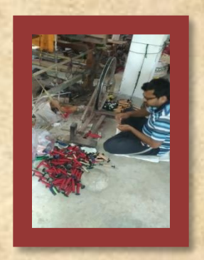
Step 5: Spinning the yarn in Dram Machine:-