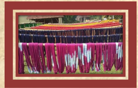
Step 3: Starching the colured Yarn:-