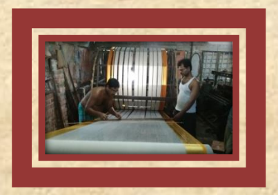
Step 7: Ready- made saree:-