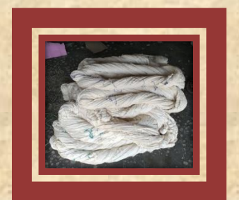
Step2: Colouring the white Yarn as per the requirements:-

6. Process of Making a Saree in Handloom: Step1: Purchase of Raw Yarn (White Colour) from the market:-